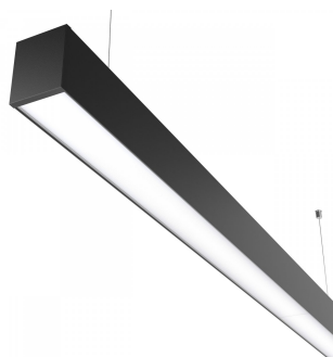
Avenue Metro Suspended