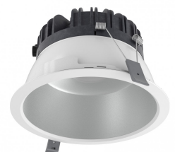
Mirage 3 C165