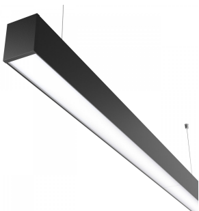
Avenue Metro Suspended