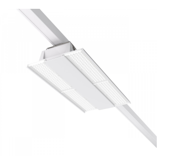
Flight Sport Trunking Mounted