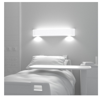
Patient examination (Florence+ 1000)