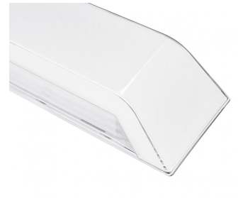
Single piece wipe clean injection moulding