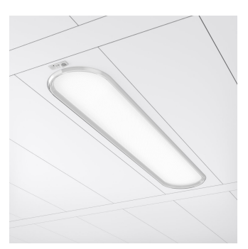
Rink Recessed with Organic Response