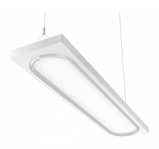
Rink Suspended White