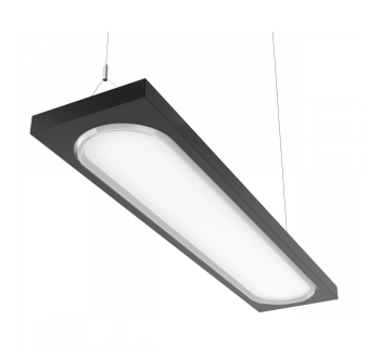
Rink Suspended Black