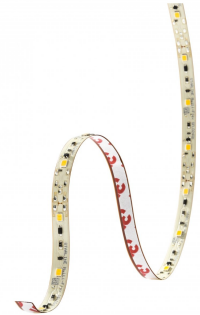
Starline Multi-Flex LD