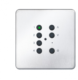
Stainless steel 7 button scene plate