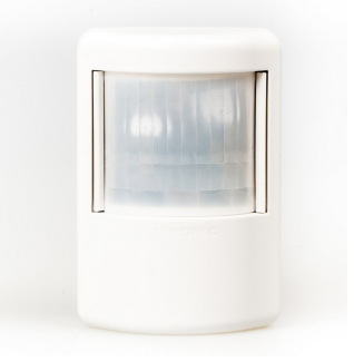
Surface mounted microwave