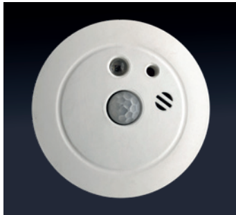
Daylight linked dimming and occupancy detection ensures that no luminaire is on when it doesn't need to be.

A dedicated multi-sensor is available to enhance the functionality of Verve, offering both daylight and presence detection and infra-red control. This discrete multi-sensor can be recessed or surface mounted, and controlled via the Verve app to perform a number of different functions. When combined with the Bluetooth mesh network feature in Verve, a single multi-sensor can control any number of luminaires. For larger detection areas, multiple multi-sensors can be used to control large groups of luminaires, or multiple groups can be configured inside a single space.