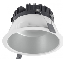
Mirage 3 IP65