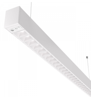
Direct/Indirect, Pod, Organic Response, White