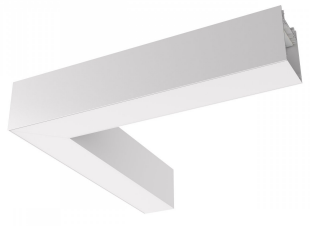
Direct/Indirect, Pod, Corner, White