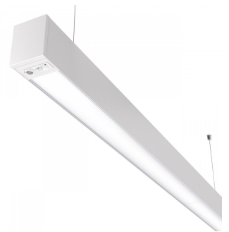
Direct/Indirect, Hexaprism, Organic Response, White