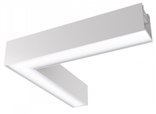
Direct/Indirect, Hexaprism, Corner, White