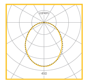
661 Lumens 7.8W LED LOR = 100.0% SHR MAX = 1.49

1322 Lumens 12.9W LED LOR = 100.0% SHR MAX = 1.49