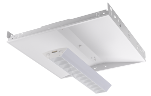
Cascade Dropped Diffuser