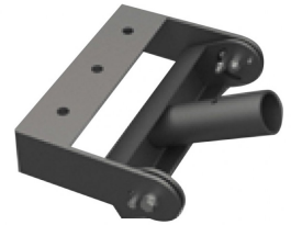
Heavy Duty Wall Bracket