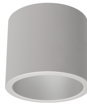
Silver body with semi-specular reflector, 160mm deep - Surface mount