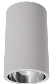
Silver body with specular reflector, 290mm deep - Surface mount