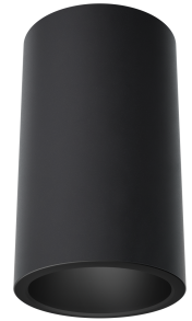
Black body with black reflector, 290mm deep - Surface mount