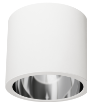
White body with specular reflector, 160mm deep - Surface mount