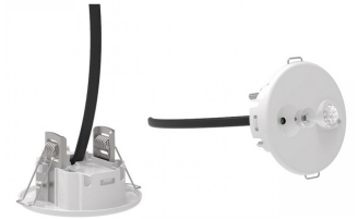
Remote recessed sensor node