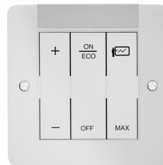
Classroom wall plate