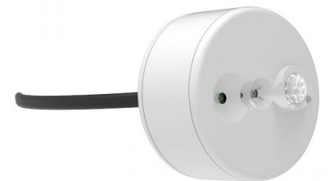
Remote surface sensor node