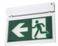
Wall mounted Exit