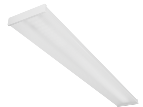
Scribe - White body