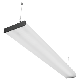
Scribe Suspended - Black body