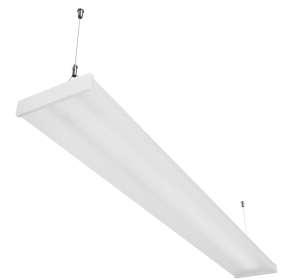
Scribe Suspended - White body