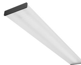
Scribe - Black body