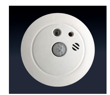
Daylight linked dimming and occupancy detection ensures that no luminaire is on when it doesn't need to be.

A dedicated multi-sensor is available to enhance the functionality of Verve, offering both daylight and presence detection and infra-red control. This discrete multi-sensor can be recessed or surface mounted, and controlled via the Verve app to perform a number of different functions. When combined with the 2.4Ghz low energy mesh network feature in Verve, a single multi-sensor can control any number of luminaires. For larger detection areas, multiple multi-sensors can be used to control large groups of luminaires, or multiple groups can be configured inside a single space.